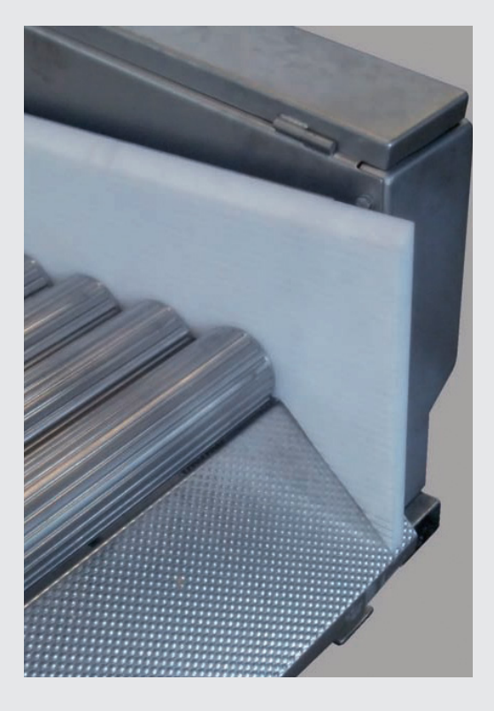
You cannot and will not do without a sliver remover.

More than 98% of the slivers will be removed and none of your product is lost.